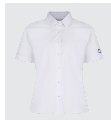
Twin Pack Shirt or Blouses