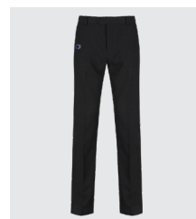
Trousers or Skirt